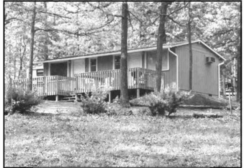
Enjoy the beauty of the outdoors from your deck.