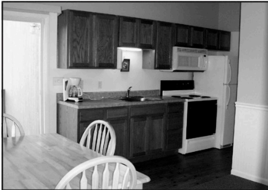
We pride ourselves on keeping our cabins clean, updated and comfortable.