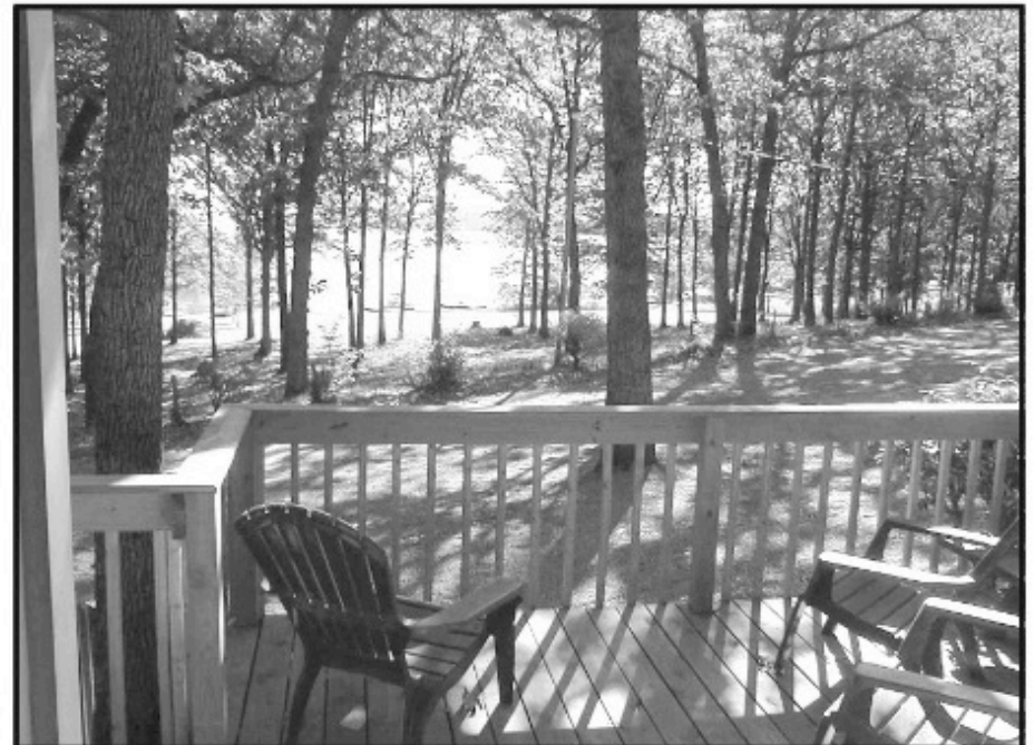
All cabins have a wonderful view of the water!